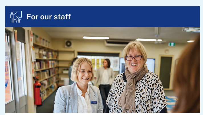
Strengthen trust and respect for the teaching profession and school support staff

Advance equitable outcomes, opportunities and experiences