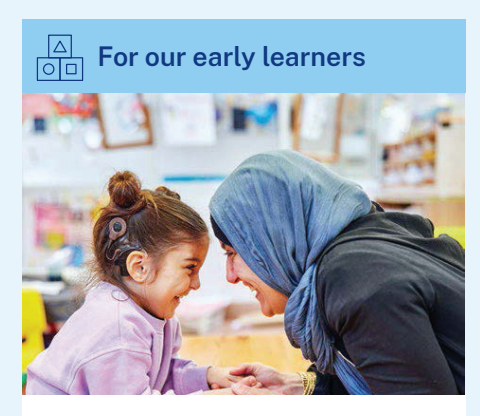
Give children the best start in learning

\stackrel{\bigcirc}{\searrow} For our school students