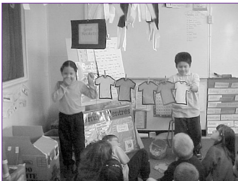
Figure 2. Mathematics provides a solution to a real life story.