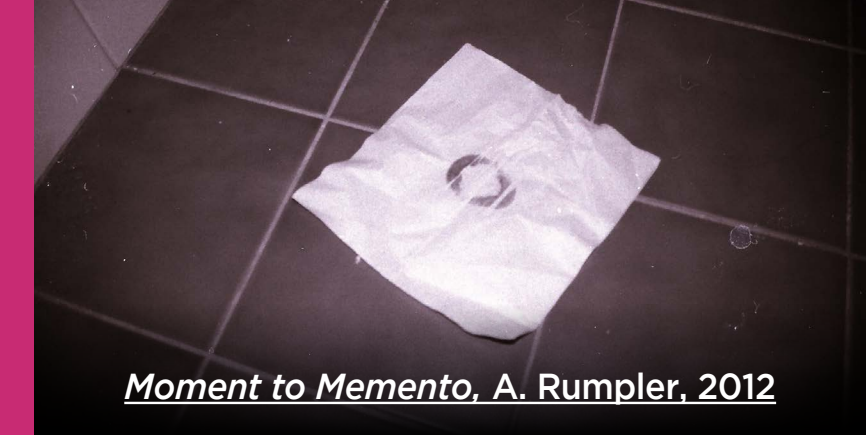
Moment to Memento , A. Rumpler, 2012

Syllabus: 5.2, 5.5, 5.10 Visual Arts Stage 6 Syllabus: P2, P5, P10, H10 Visual Design CEC Stage 6 Syllabus: DM2, DM5, CH4