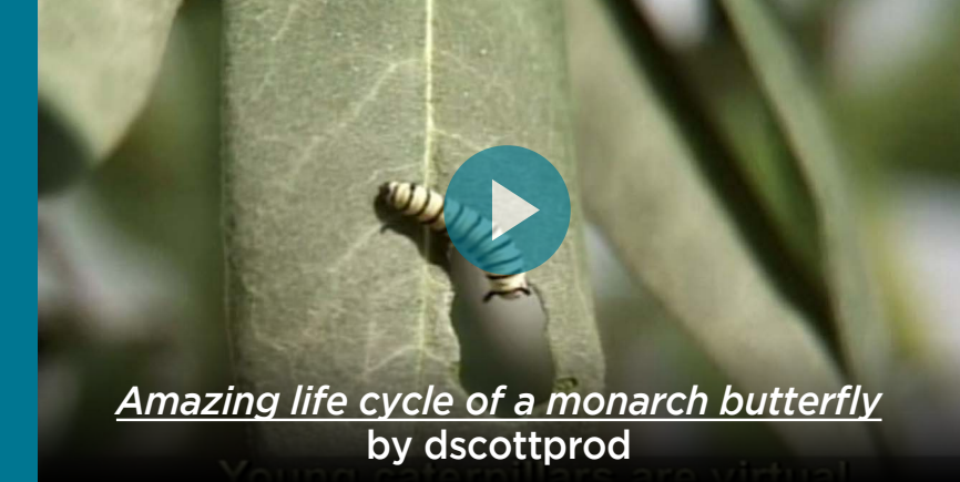
Amazing life cycle of a monarch butterfly by dscottprod