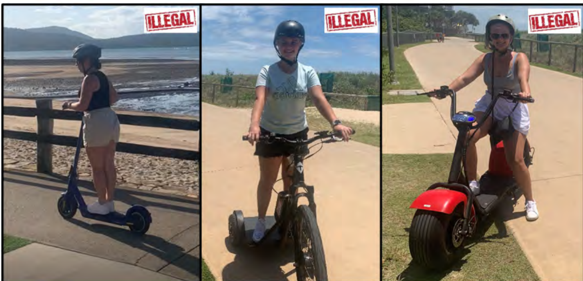
Illegal riding of motorised wheeled devices.

Share the facts on riding motorised wheeled devices in NSW with your school community.