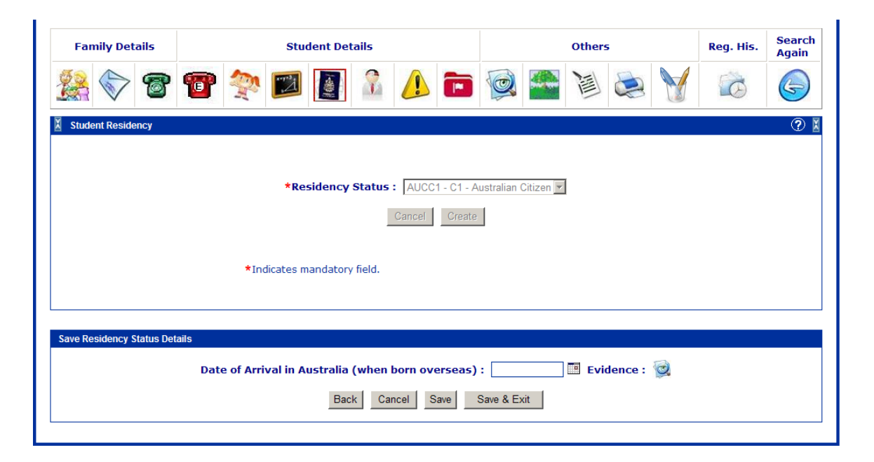
C1- Australian Citizen is successful created