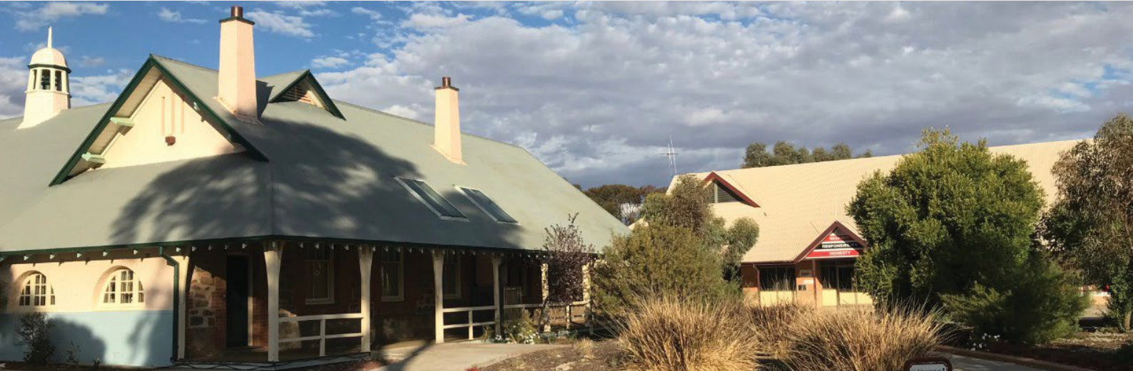
Burke Ward Public School