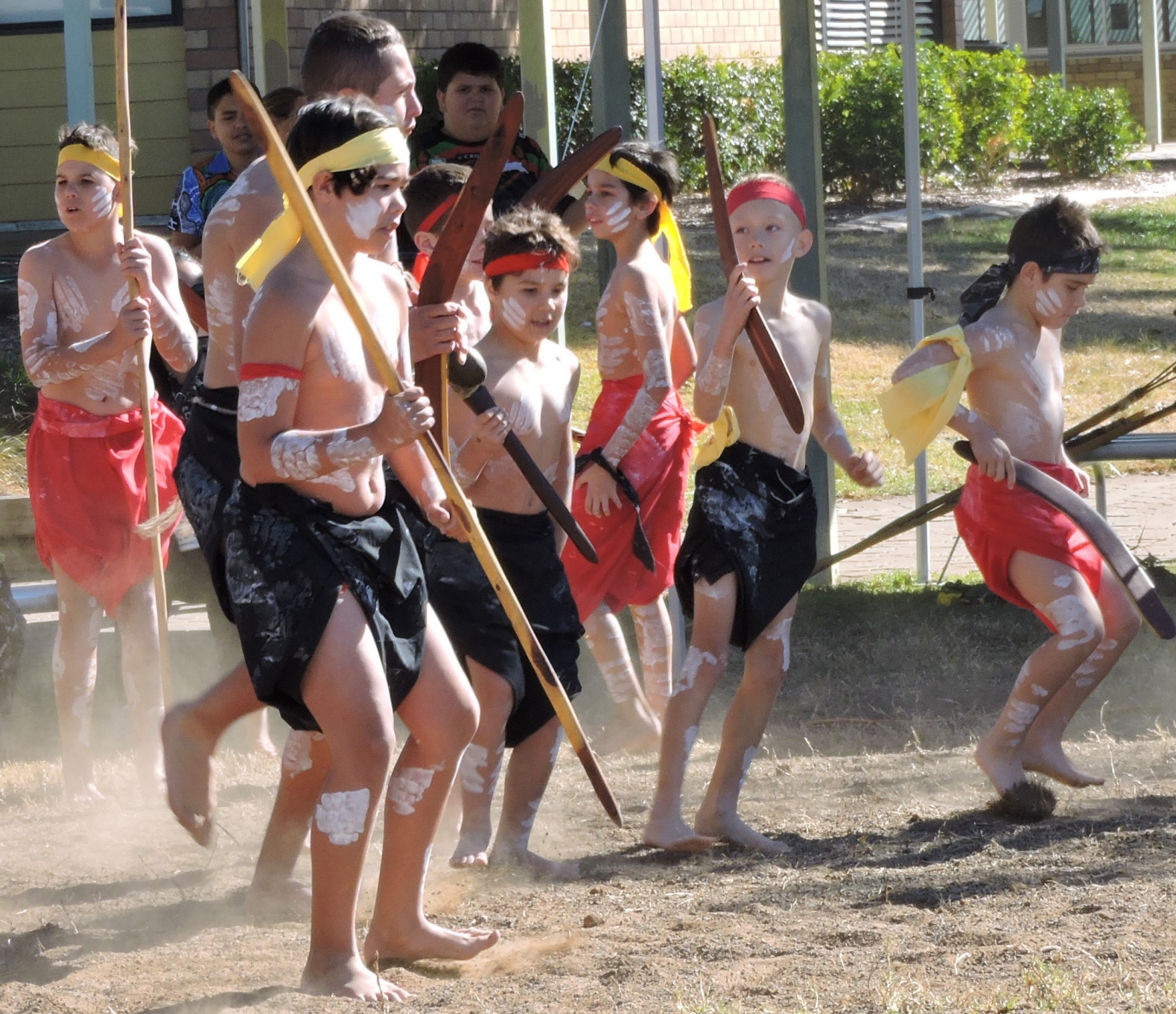
Pictured above: Narrabri Public School. Cover: Walhallow Public School.