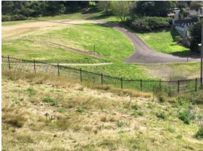
Picture 1 – Exclusion zone fencing surrounding north-western hotspot area